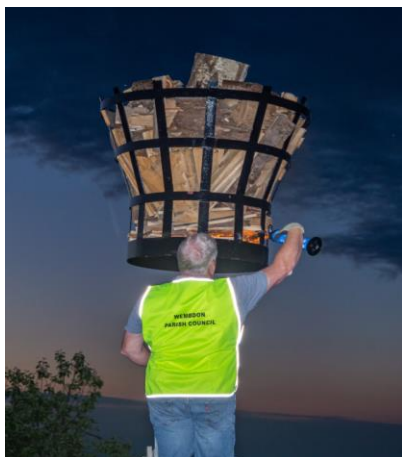
The beacon being lit

On Friday 3 rd June , there was a short service of Thanksgiving for the 70 years reign of Elizabeth II, at St George's Church. This was preceded by St Georges Church Wembdon Bell Ringers giving a stirring peal. A moving tribute, with some video clips and favourite hymns, was accompanied by the church organ.