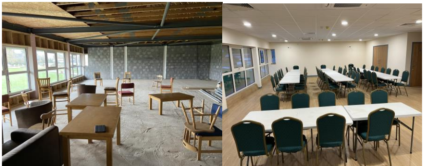
Work underway and the finished room

There is still a small amount of finishing work to be done but the room is now ready for use and we were pleased to have our first event in it on 30 th June when we hosted the English Schools Under 15 cricket finals day which involved 55 young people.