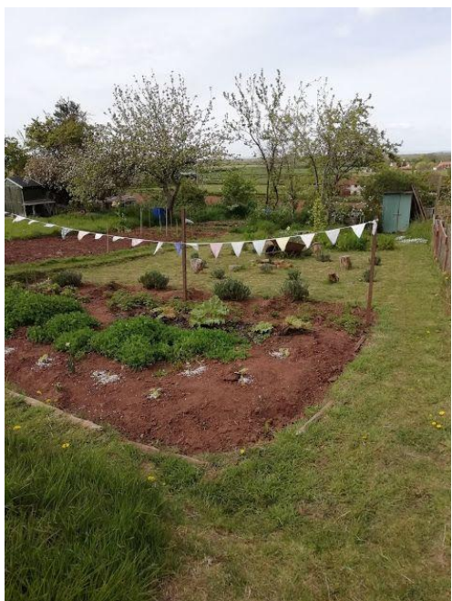
Images of Wembdon Allotments