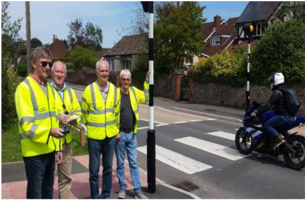
PLEASE SLOW DOWN

This month we have recorded an instance of a driver going at <u>65 mph</u>, just yards from the zebra crossing.