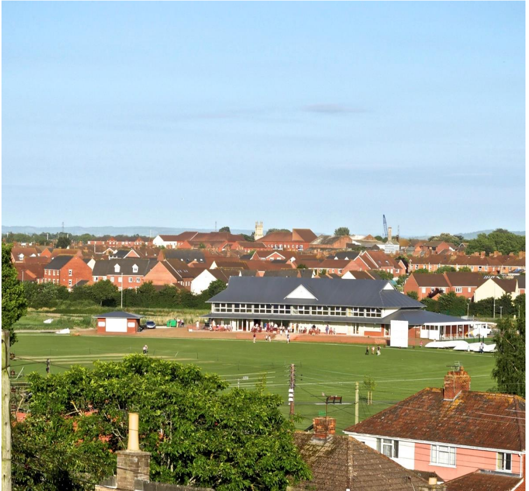
Wembdon Village 2017 viewed from Downhall Drive.