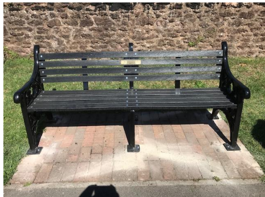
One of the new benches on The Common outside the Parish Centre