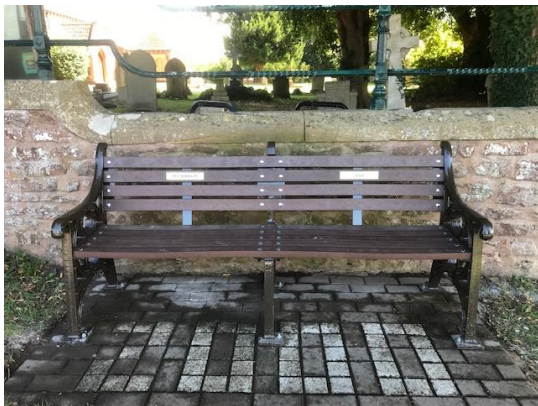
The new Millennium Bench