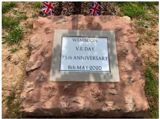
Above – Temporary VE Day 75 th Anniversary Plaque