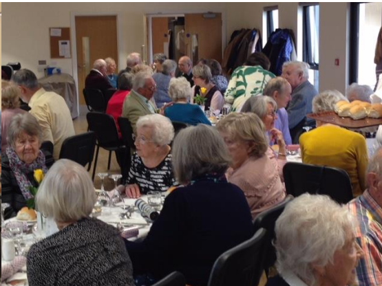
Photos of the WCA Senior Citizen's Christmas Meal